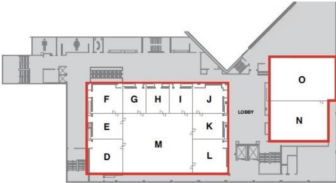
Third Floor East Meeting Rooms